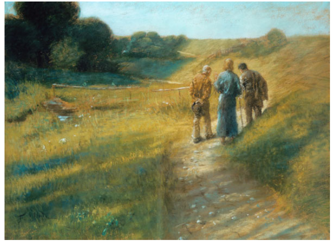
(The Road to Emmaus / Fritz von Uhde)

"Jesus became what we are that he might make us what he is." (St. Athanasius – Feast Day May 2)